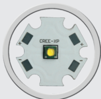
LED light source(CREE)